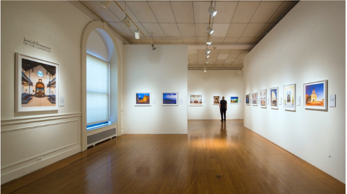
The Gershman Y - Philadelphia, PA