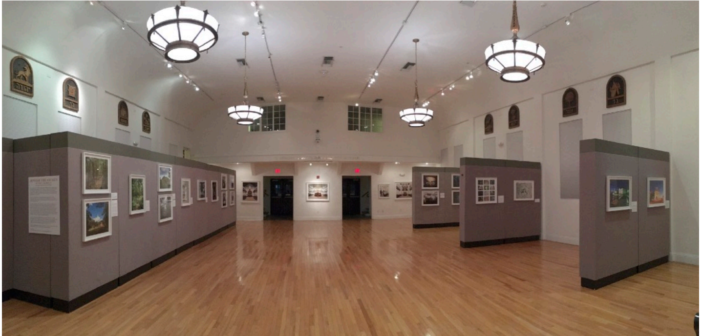
Jewish Museum of Florida - FIU - Miami, Florida