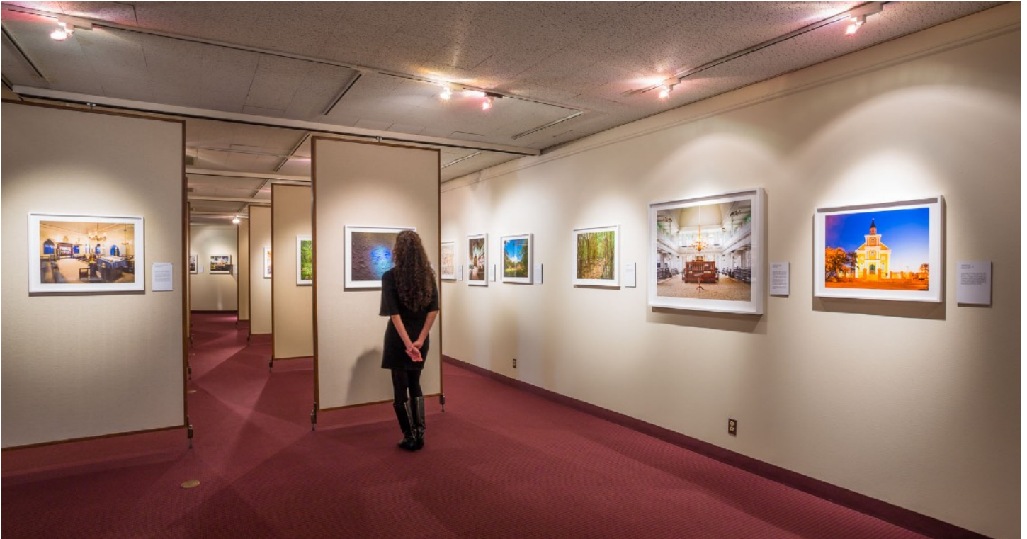
Temple Emanu El - Houston, Texas